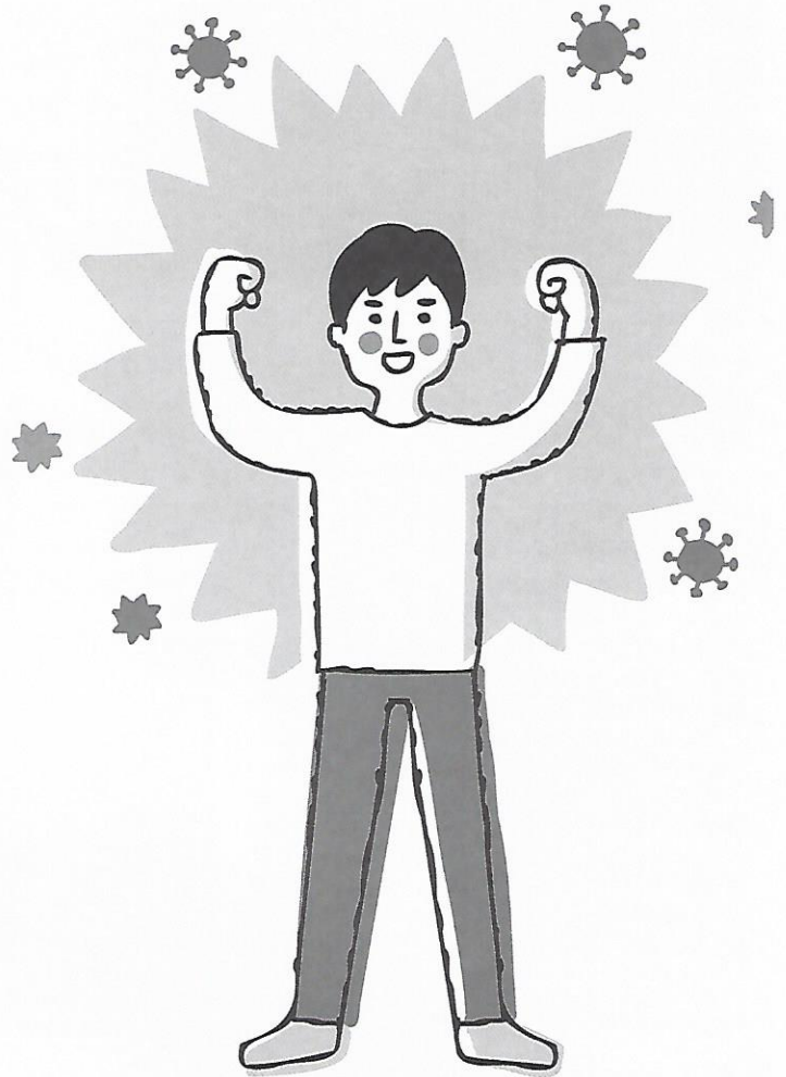
Sense of strength in immune system after dosing