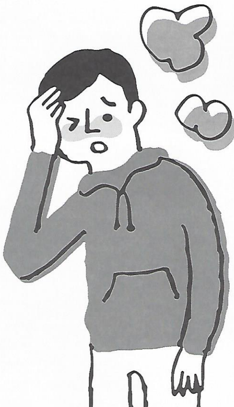
Feeling tired, fatigued ...